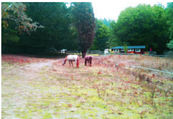
Robin and Teddy retired to a life of luxury.

When we sent out invitations to riders who had loved them over the last twenty years, we got back some wonderful comments. Many told us Robin or Teddy was the first horse they ever rode, or the best horse they ever rode, and one Miwok alum said "Robin was the first horse I fell off of!" They taught generations of students, and we loved them for their boundless sweetness. May the brothers enjoy a long and happy retirement. They earned it.