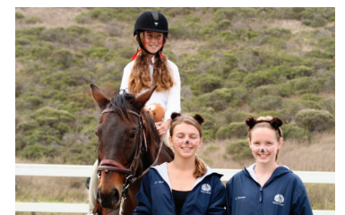
Just a few of the inspired costumes at the Miwok Show.